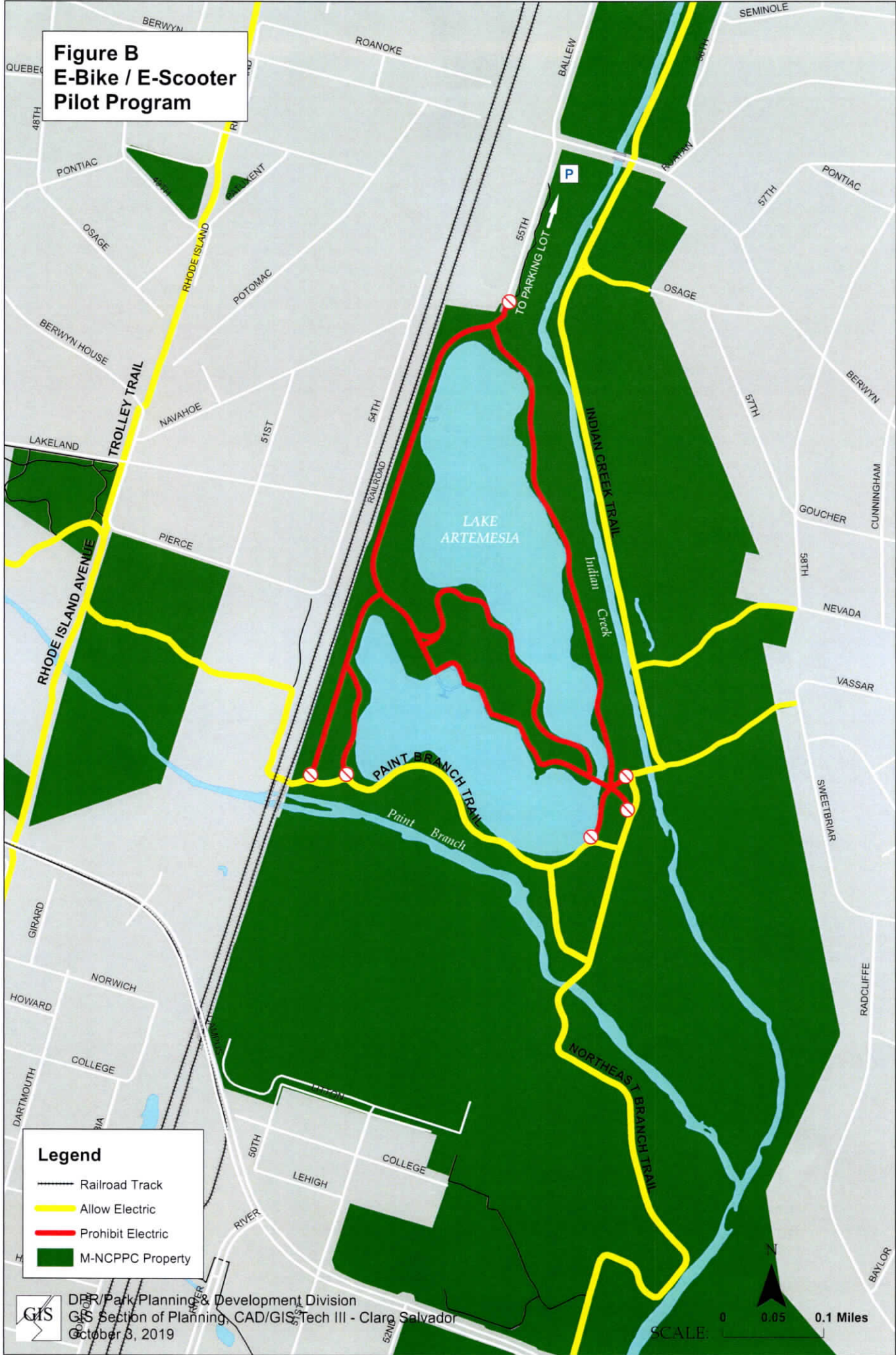
Figure B E-Bike / E-Scooter Pilot Program