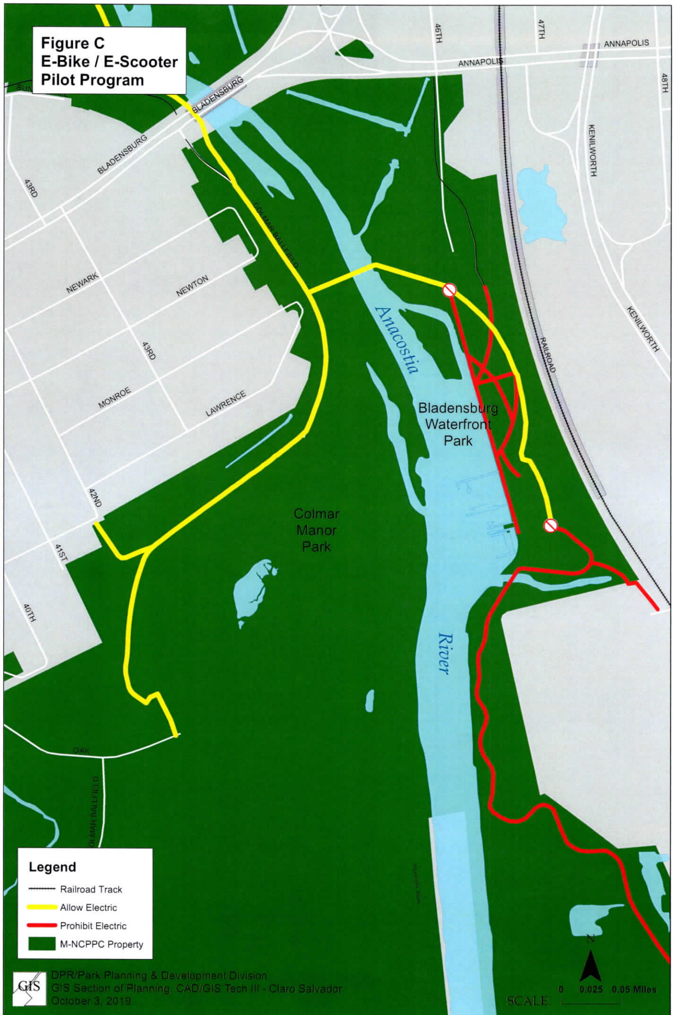
Figure C E-Bike / E-Scooter Pilot Program